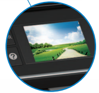
2.5" LCD screen